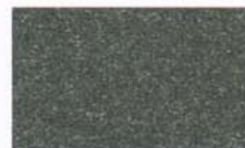
Vega Flannel Grey

Woodgrains (Available in sheet size 3660 x 1510)